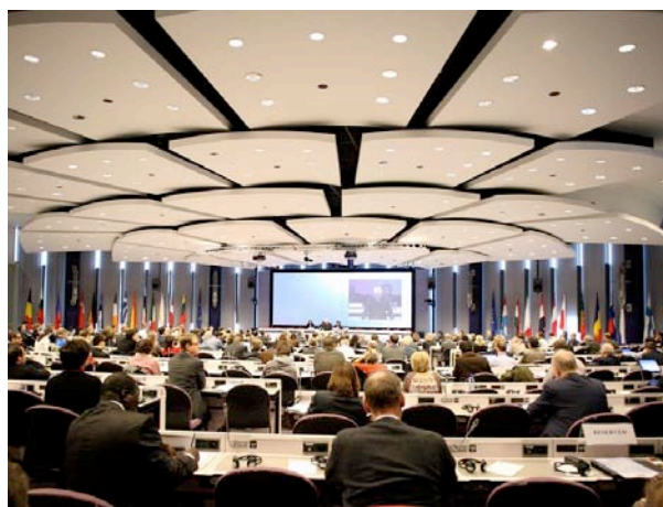
Opening session of the PARADISO conference organised in January 2009 at the European Commission in Brussels